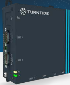
Edge Connectivity and Automation