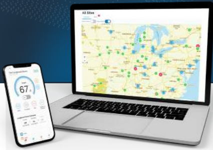
Cloud Insight and Control Center

that brings together electric machines with optimal efficiency, edge connectivity, automation, cloud insights, and control.