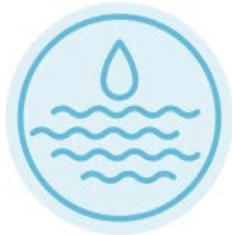
Water Efficiency Project of the Year