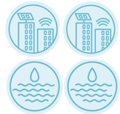
Portfolio of the Year