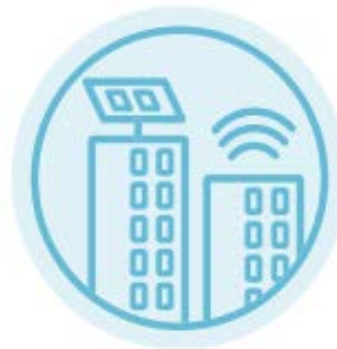
Energy Efficiency Project of the Year