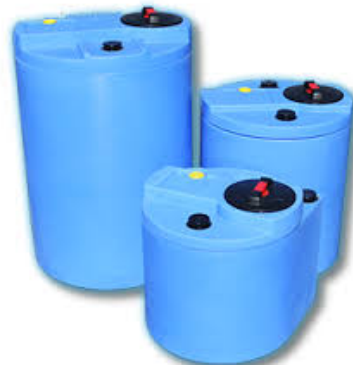
Double Containment Tanks