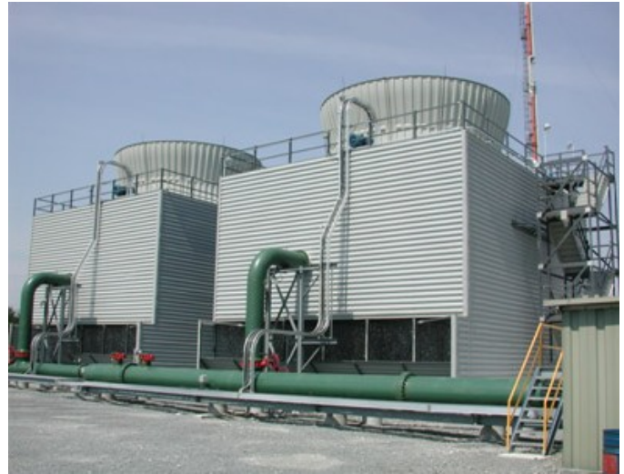
Cooling Tower Treatments