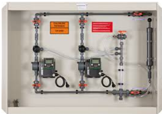
Board Mounted Feed